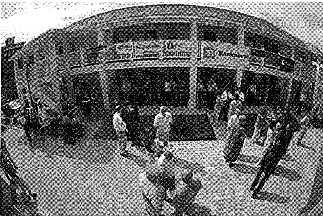
The recently completed building C at the new Straw Mansion Apartments.